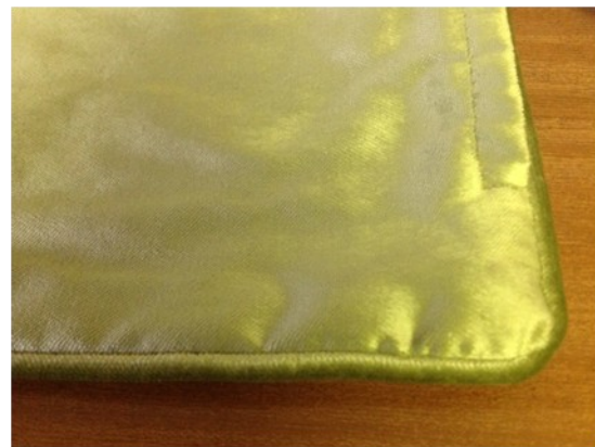
Special folder and gauge set for piping on upholstery