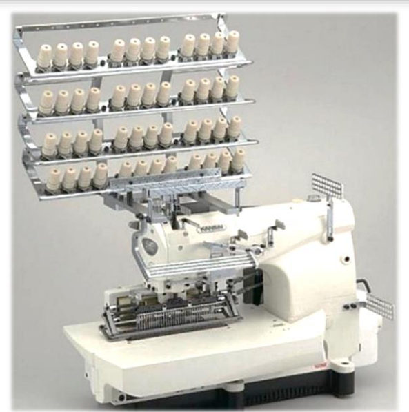
Photo: Double chain stitch (1433) model, MD2 device is not attached.

33 needle flatbed single chain stitch machine for simultaneous shirring and smocking with 9 different cams for various designs