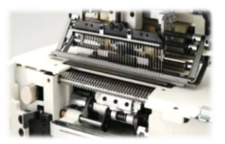
4 spreaders for the decorative thread increase the number of design patterns.