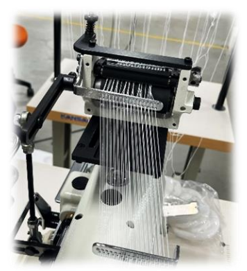
MD2: Equipped with a metering device, the rubber threads are beautifully finished.