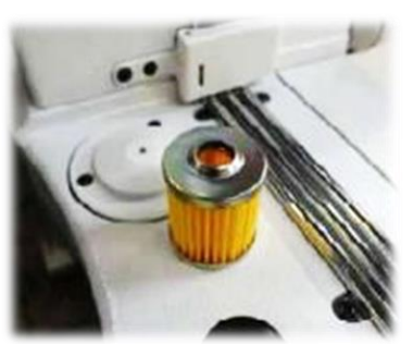
New oil filtering system for clean oil and long durability.

Differential feed mechanism ensures prevents puckering.