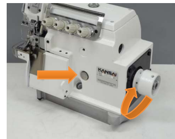
Push-button stitch length adjustment For easy operation