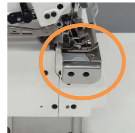
Cylinder bed 148mm circumference