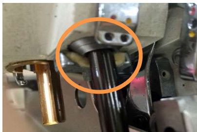
Needle bar oil return system Protects the fabric from the oil stain